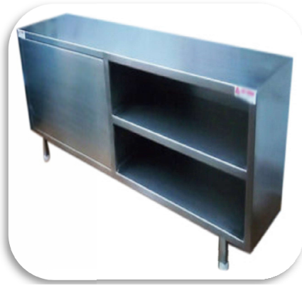
SS CROSS OVER BENCH