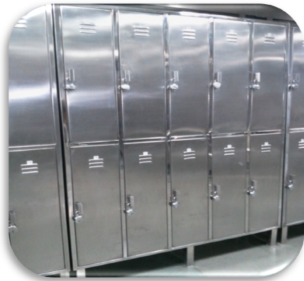
SS GARMENT LOCKER