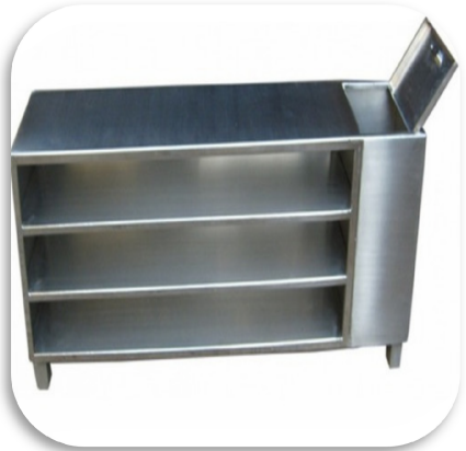
SS CROSS OVER BENCH