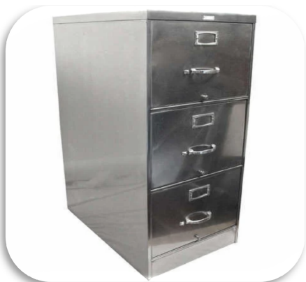
SS FILE CUPBOARD