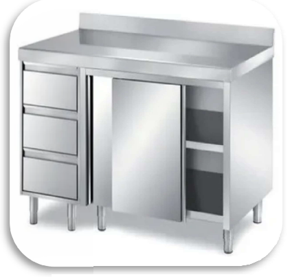
SS OFFICE TABLE