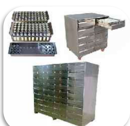
SS DIE PUNCH CABINET