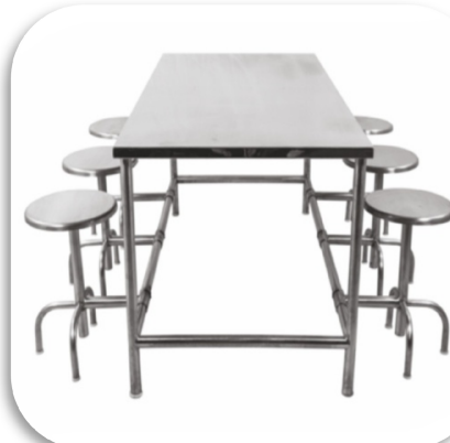
SS CANTEEN TABLE WITH STOOL