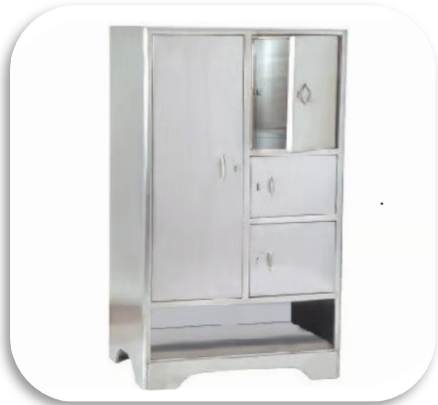
SS APRON CABINET