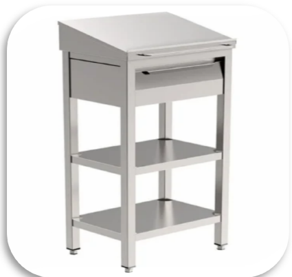
SS WRITING TABLE