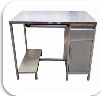
SS COMPUTER TABLE