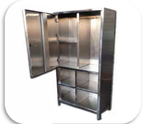
SS SIEVE SCREEN CABINET