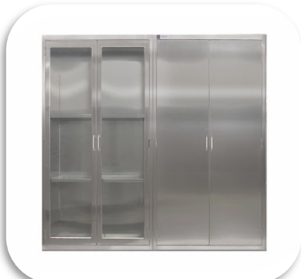
SS INSTRUMENTS CUPBOARD