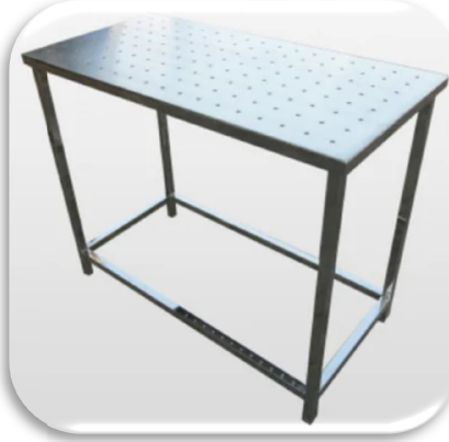
SS PERFORATED TABLE