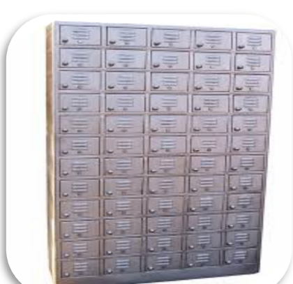
SS SHOES LOCKER