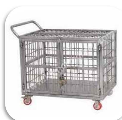
SS CAGE TROLLEY