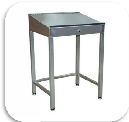
SS WRITING TABLE WITH DRAWER