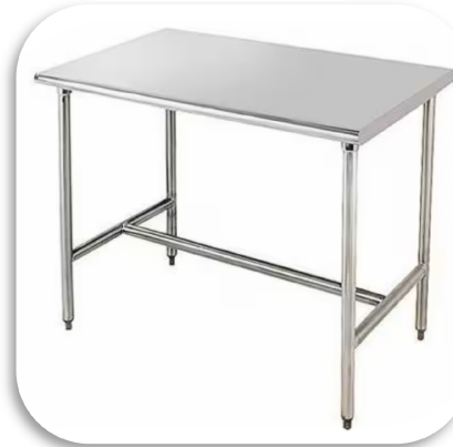
SS WORKING TABLE