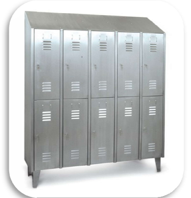
SS APRON CABINET