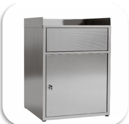
SS USE GARMENT BIN